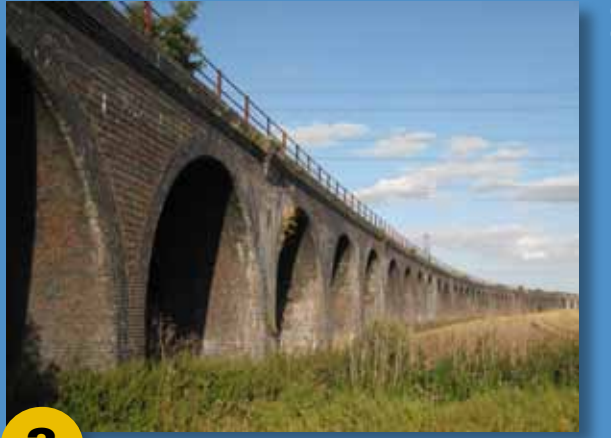
3 PUBLISHED BY LINCOLNSHIRE COUNTY COUNCIL