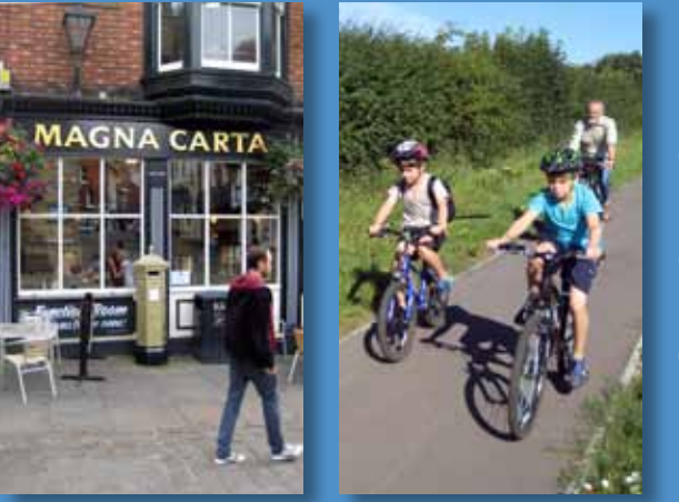
CYCLING MAP 2012